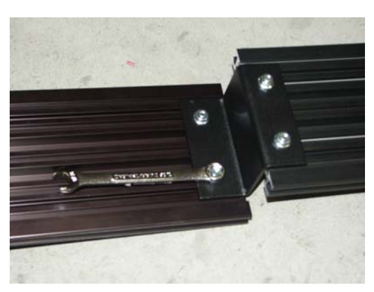
Attach the extrusion adapter bracket to the 12" section of extrusion using (2) 1/4" x 3/4" bolts and serrated nuts. (7/16" Wrench)